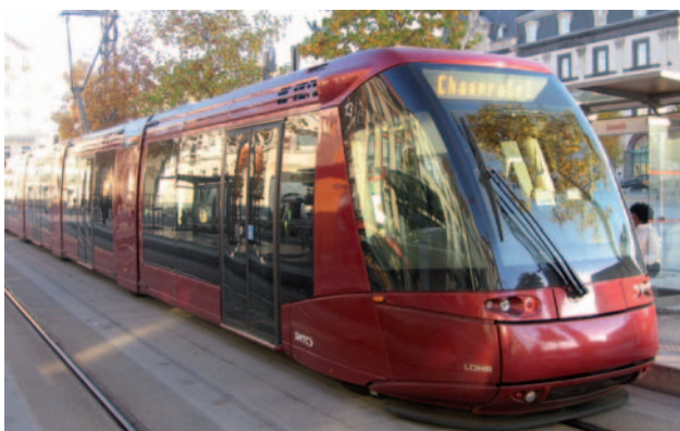
The “tramway on tyres” Translohr in Clermont-Ferrand

The tramway is an on-road guided TCSP system that always follows a given trajectory, running on one or more physical rails. This category therefore includes the Translohr , “Tramway on tyres” system developed by the manufacturer Lohr, a guided system on tyres distinguished by the fact that it is physically and permanently guided by a rail. This means that it is not covered by the French Highway Code, particularly in so far as the size of its vehicles is concerned.