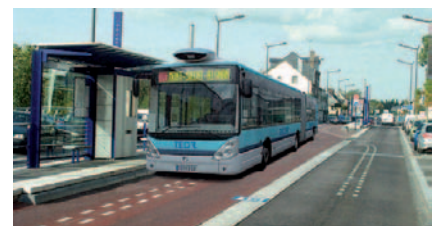
The guided BHLS TEOR in Rouen

The TVR from Bombardier, a guided system running on a central rail that is subject to the provisions of the French Highway Code, is therefore classed as a guided BHLS. The Phileas from APTS, which is currently being developed, should also be included in the guided BHLS category, subject to the vehicle being authorised in France by the relevant authorities.