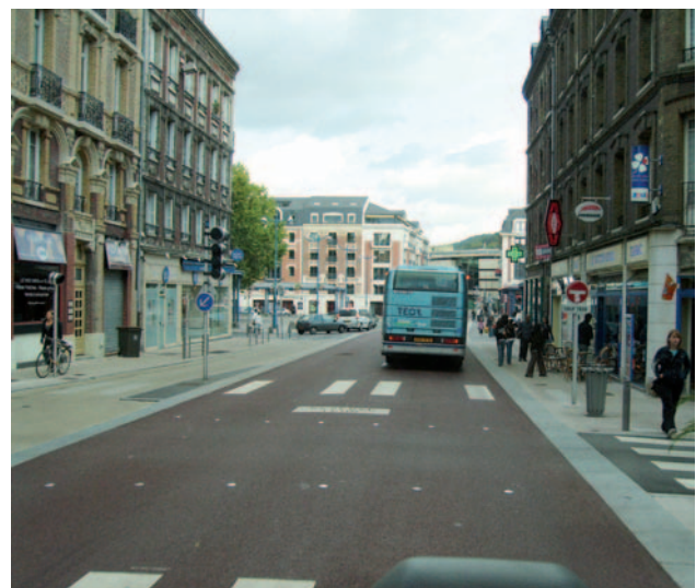
Avenue Alsace Lorraine in Rouen before and after the development of the TEOR