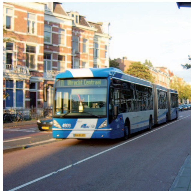
Van Hool AGG 300 bi-articulated bus in Utrecht

BHLS vehicles are in fact limited by the French Highway Code to 24.5 m in length and 2.55 m in width, excluding wing mirrors. Currently, apart from the Bombardier TVR in Caen and Nancy, only standard or articulated buses (maximum 18.75 m long) operate in France. In other countries, some conurbations operate non-guided, bi-articulated buses (e.g. the Van Hool AGG 300 in Utrecht and Hamburg, and Hess vehicles in Switzerland and Luxemburg). Manufacturers working in this field are expected to launch new rolling stock in the next few years. Several French conurbations, including Nantes and Nîmes, have shown an interest in this type of vehicle.